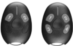
SA-23-B2/B4 Transmitters for AY-L23 Reader