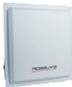
AY-U900 UHF Integrated Long-Range Reader