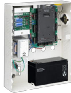
AC-225 Advanced Scalable Networked Access Controller