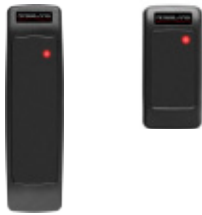
AY-L23 Extra Long-Range RF Reader