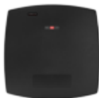
AY-Z12A Long-Range Outdoor Proximity Reader