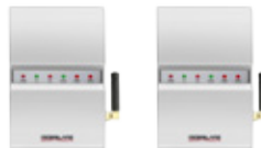
MD-W11N/F/BP Wireless Access Control Door Interface Near/Far Unit + Power Backup Unit