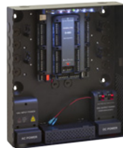
AC-825IP Advanced Scalable Networked Access Platform